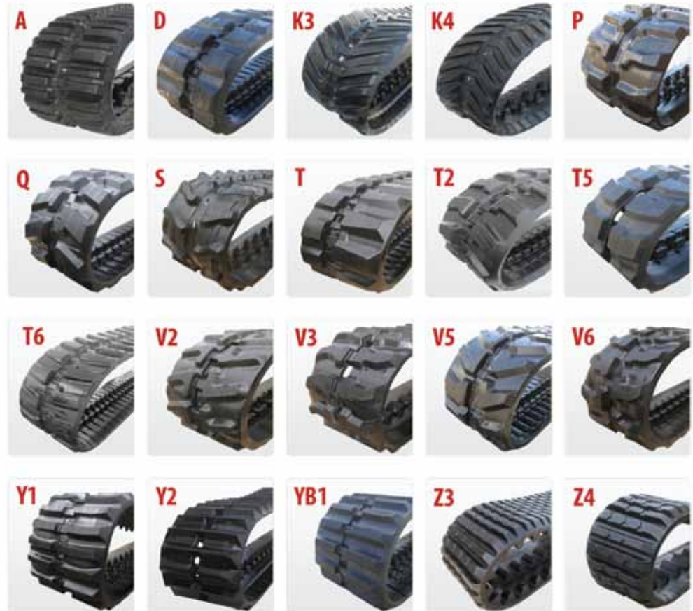
Tread pattern images are for illustration only. Actual tread patterns vary by track size and SKU.