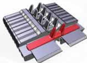
MAXIMIZER NEXT GENERATION NEXTGEN TDF NEXTGEN TURF